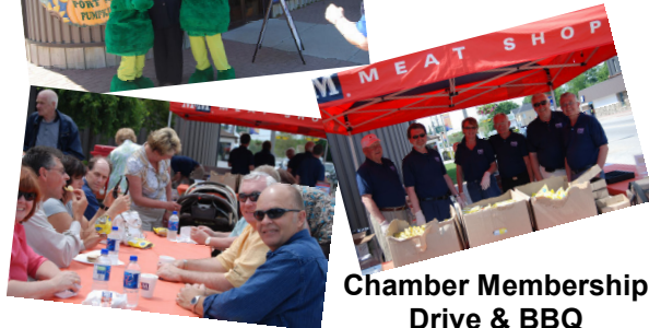
Chamber Membership Drive & BBQ