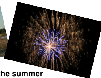
We ended the summer with a BANG! Labour Day Fireworks