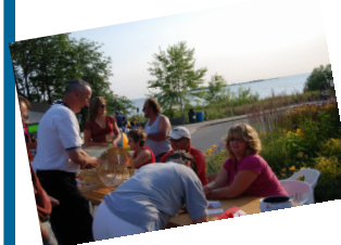
Canada Day & Cruiser's Cruise Nights